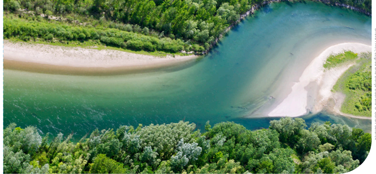
Drava river, Legrad and Donja Dubrava

The views expressed in this publication do not necessarily reflect the position of the Office of the Croatian Government for Associations.