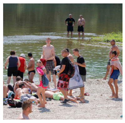
Natural rivers provide relaxation for local people and are basis for nature-friendly tourism.