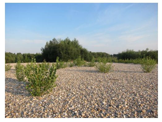
Native floodplain forest only rejuvenates on pioneer habitats created by dynamic rivers.