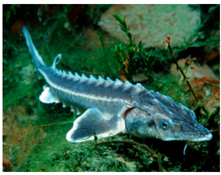
Undisturbed natural floodplains are necessary to protect iconic species like White-tailed Eagle and Danube Sturgeon